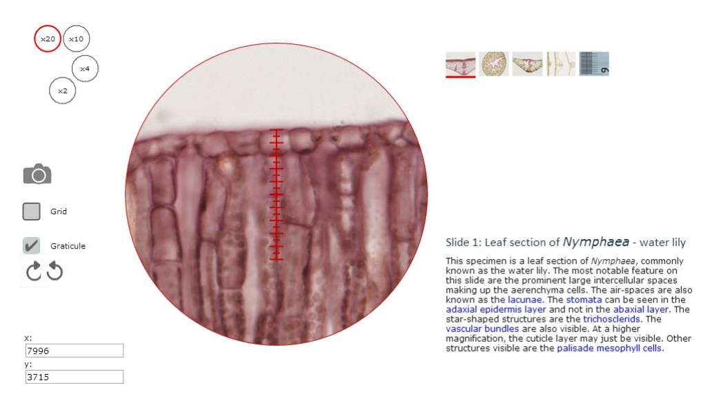
Figure 1 A screen shot of the digital microscope showing the epidermal layer of a leaf section of Nymphaea , leaf viewed with a x20 objective lens. The graticule is overlain on the image and correctly orientated to measure the thickness of the upper epidermal layer. The correct measurement in this instance is 2.0 large units on the graticule.

Epidermal layer thickness : Choose a clearly defined epidermal layer and measure its width. They may be more than one cell thick. Indicate whether it is the upper or lower epidermal layer. To do this you need to use a graticule, which is a fixed scale etched onto a piece of glass that you can insert into the eyepiece of a microscope in order to measure items. In the digital microscope, simply click on the box labelled "Graticule" and a tick will appear. You will see a red line divided into 10 large (or 20 smaller) divisions. You can rotate the graticule in order to line it up with the item you wish to measure. Click on one of the two circular arrows beneath the "Graticule" checkbox to rotate it.